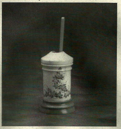
DH 1238 Bath Set Toilet Brush Holder