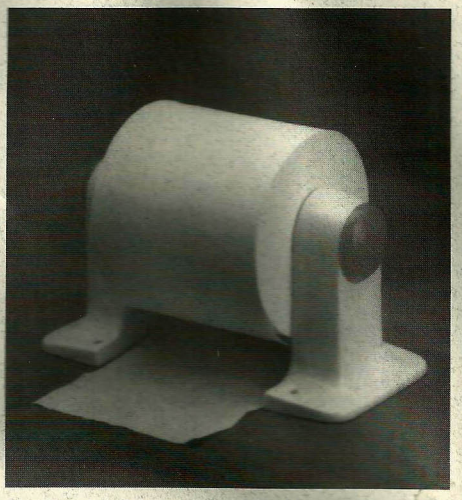
DH 1241 Bath Set Towel Rail End