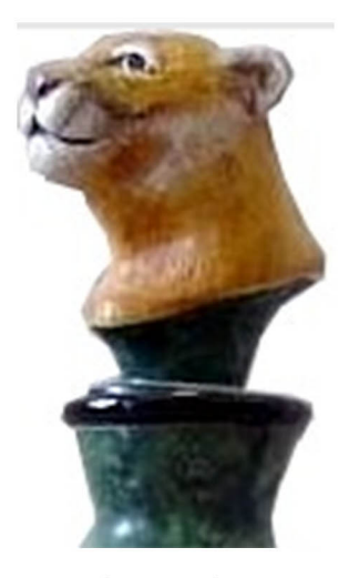
DH 747 Stopper, Cougar for DH 621 4" T