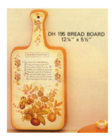
DH 195 Bread Board 12.5" x 5.5"