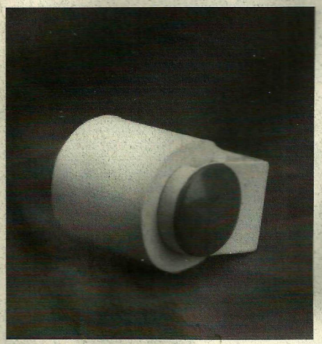
DH 1240 Bath Set Slot Toilet Roll Dispenser