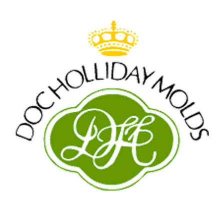
For More Information Contact

Starlite Mold Company 1518 S. Washington • Wichita KS 67211 Phone:(316)-262-3350 • Fax(316)262-1396