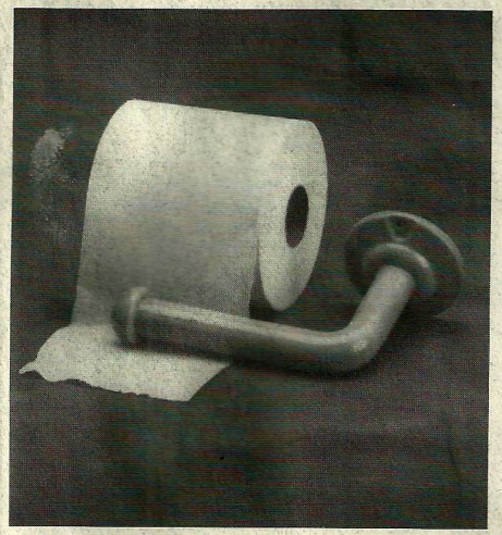
DH 1245 Bath Set Bent Toilet Roll Dispenser