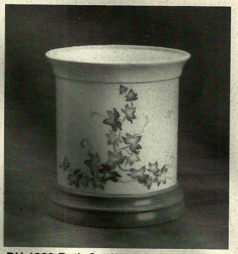
DH 1239 Bath Set Wastepaper Holder