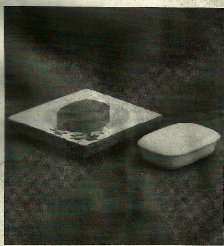
DH 1244 Bath Set Soap Dish DH 216 Soap Dish