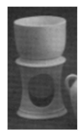
DH 515 Cup, Potpourri and Pedestal 5.75"T