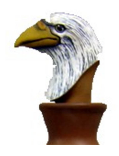
DH 746 Stopper, Eagle for DH 630 4"T