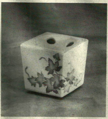
DH 1242 Bath Set Tooth Brush Holder