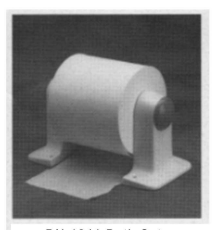
DH 1241 Bath Set Towel Roll End