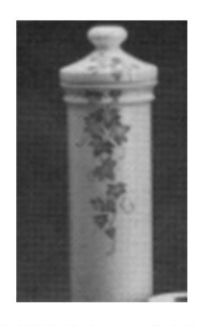
DH 519 Cup, Potpourri DH 1238 Holder, Toliet Brush 11.5"T