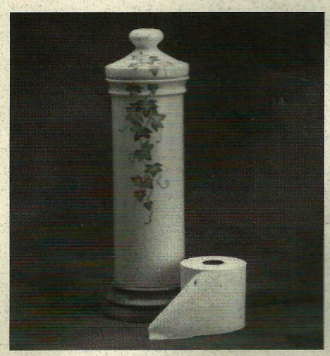
DH 1235 Bath Set Toilet Roll Holder DH 1236 Bath Set Lid DH 1237 Bath Set Lamp Lid