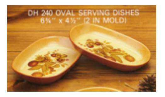
DH 240 Oval Serving Dishes 6.5" x4.5" (2 in Mold)