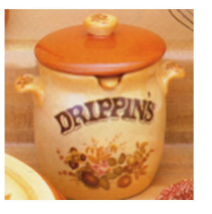
DH 275 Grease Jar with Strainer 6.5"T