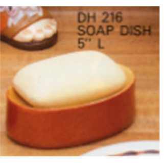
DH 216 Soap Dish 5" L